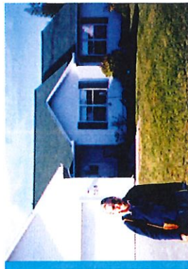
Provide for home ownership.