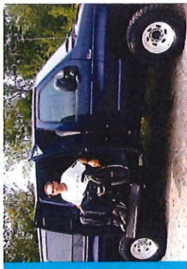
Provide for modified transportation.

Serving the disabled and their families since 1993.